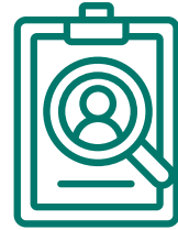
RIGOROUS WORKER VETTING & COMPLIANCE