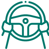
INFRINGEMENT MANAGEMENT (DRIVERS)