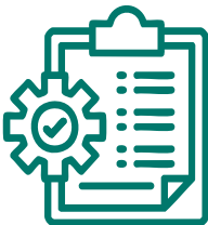
REPORTING & ANALYTICS