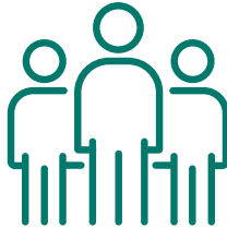
CANDIDATE POOL (25,000 PLUS)