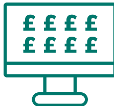
HEAVY TECHNOLOGY INVESTMENT