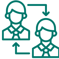
DEDICATED ACCOUNT TEAM